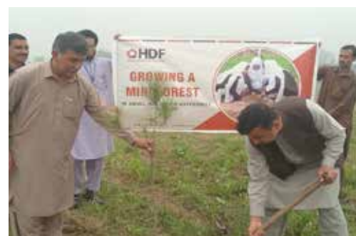
HDF Team along with AWKUM students and Faculty Plant the Seeds of a Future Mini Orchard