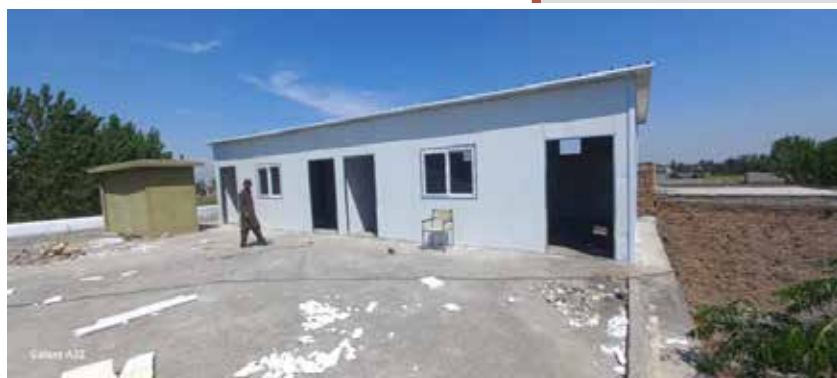
After: A New Classroom is Creating Space for Educating More Girls