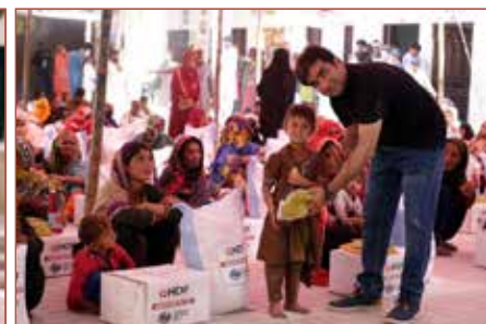
Pictorials from Ramadan Food Pack Distribution in Tando Muhammad Khan