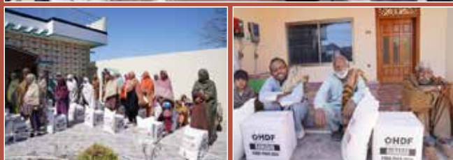
Pictorials from Ramadan Food Pack Distribution in Soon Valley