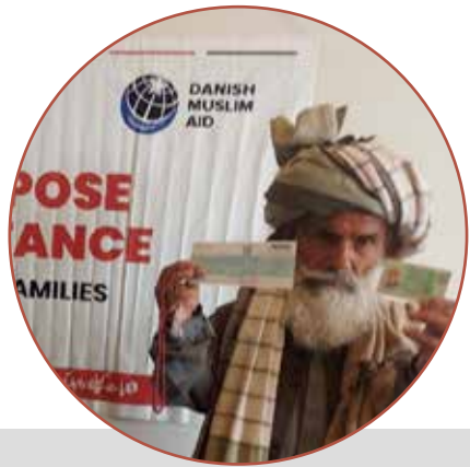
Pictorials from Zakat Distribution in Zhob

We are incredibly grateful to Danish Muslim Aid for their generous support, which made this impactful Zakat distribution possible. Together, we were able to bring joy and relief to families in need during a special time of year.