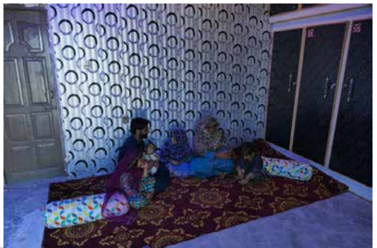
A Flood Displaced Family Moves in to Their New Humble Abode in Moula Bux Brohi