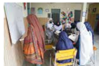
Before: Students Studying in Hallways Due to Space Limitation