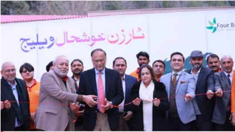
March 07, 2024: HDF Joins Four Brothers Group Pakistan in Inaugurating the Tarzan Khushal Village Program

HDF has joined forces with Four Brothers Agri Services Pakistan to empower local farmers through the innovative "Tarzan Khushal Village" program. This transformative initiative aims to propel Pakistan towards economic prosperity by revolutionizing agriculture.