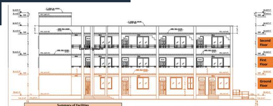
Sample 2-D Model

to support the expansion of HDF Girls High School in Gurdas, Mardan.